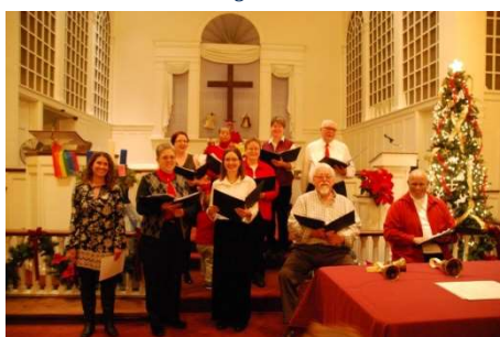
The choir rehearses for their processional.