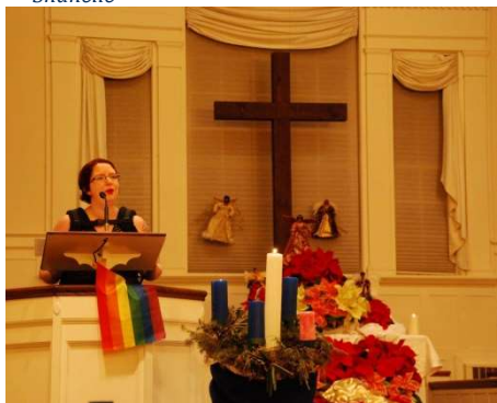
Christmas Eve Message: Peace