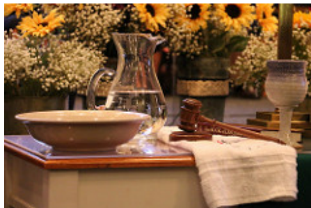
Some of the elements of the episcopacy, representing a Bishop's call to Word, service, administration and vision.