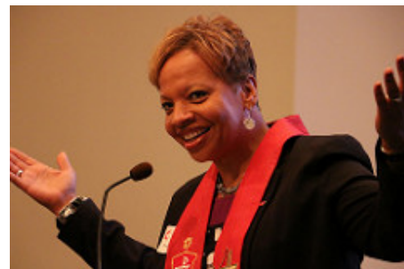
Bishop Tracy Smith Malone offers a moving and powerful introductory message as she takes on the mantle of leadership in East Ohio.